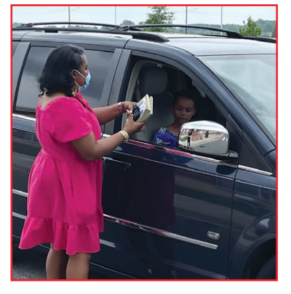
Drive By Day for Fourth Graders