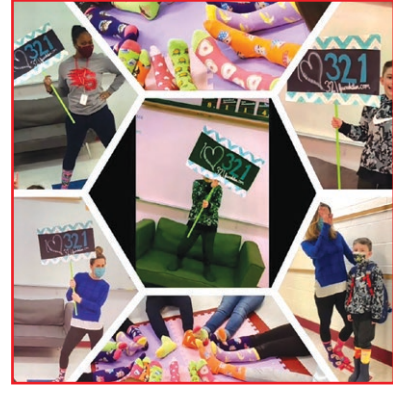
Rock your Socks! Students and teachers show off their fancy feet.