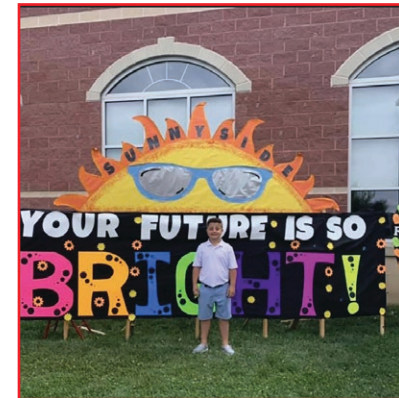
The Future is Bright! We are proud of all our students for the hard work they put in each day.