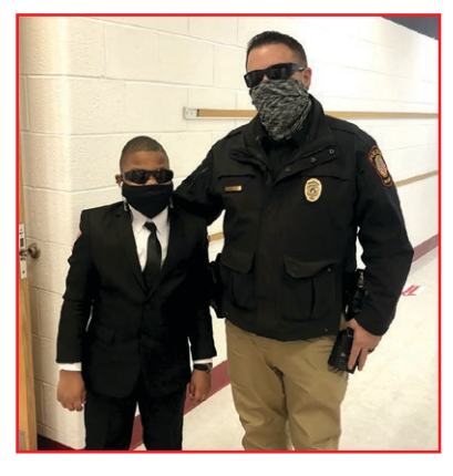
What do you want to be when you grow up? Students dream about a future career